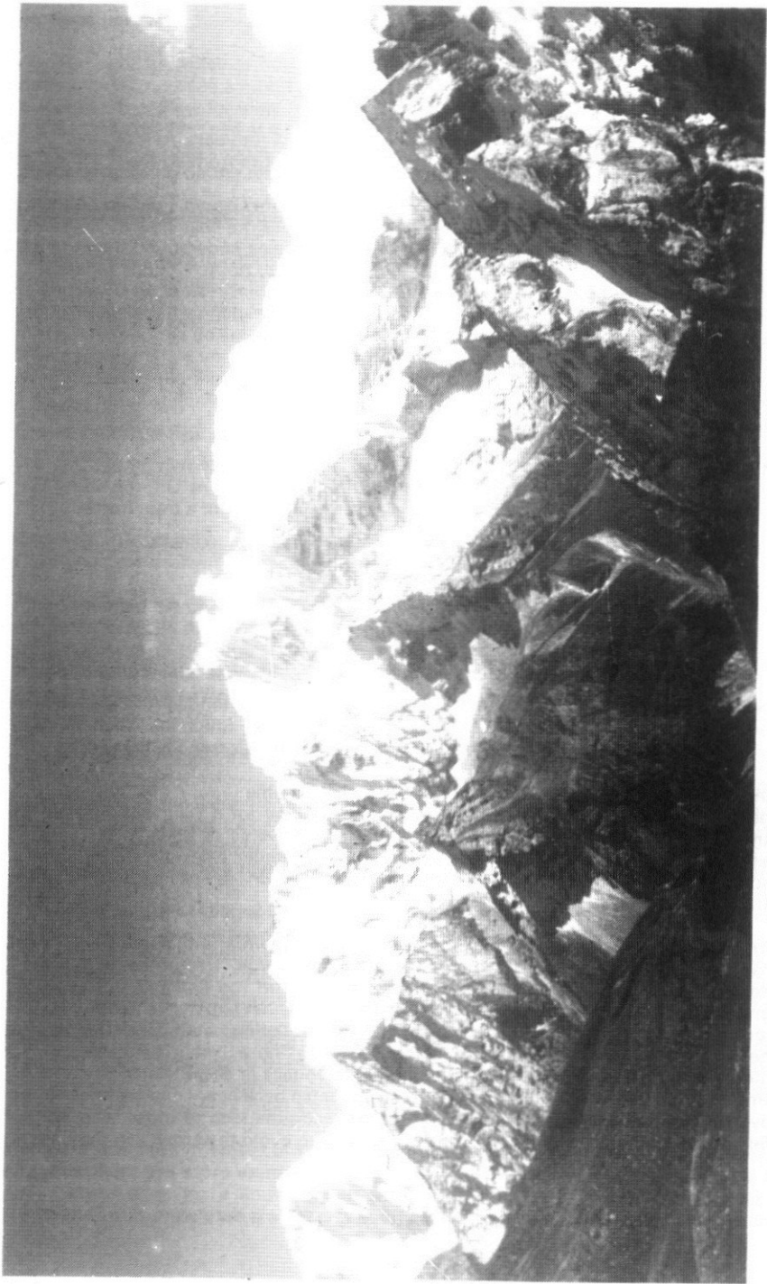
Tilman's "Fluted Peak" From Tserko.